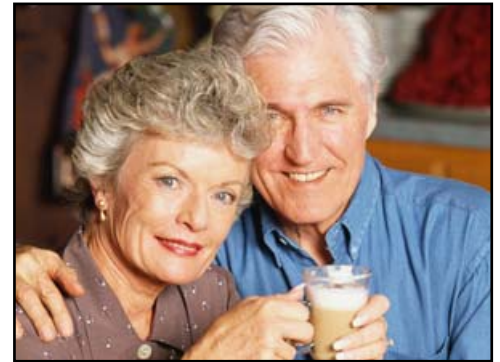
In time, you'll adjust to dentures

Like learning any new skill, eating with your new denture will at first feel awkward. But with time and practice, you'll make the adjustment. Nobody likes to lose their teeth, but when your teeth are infected, removing them and getting an immediate denture can improve your health, smile, and confidence.